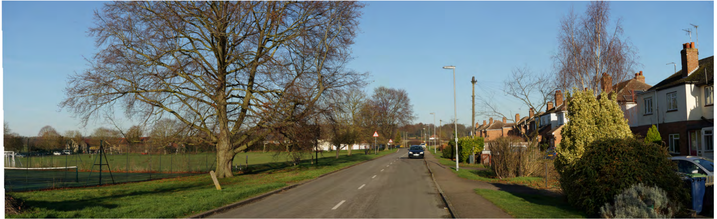
View from Haverhill Road looking north - Viewpoint E (Winter)