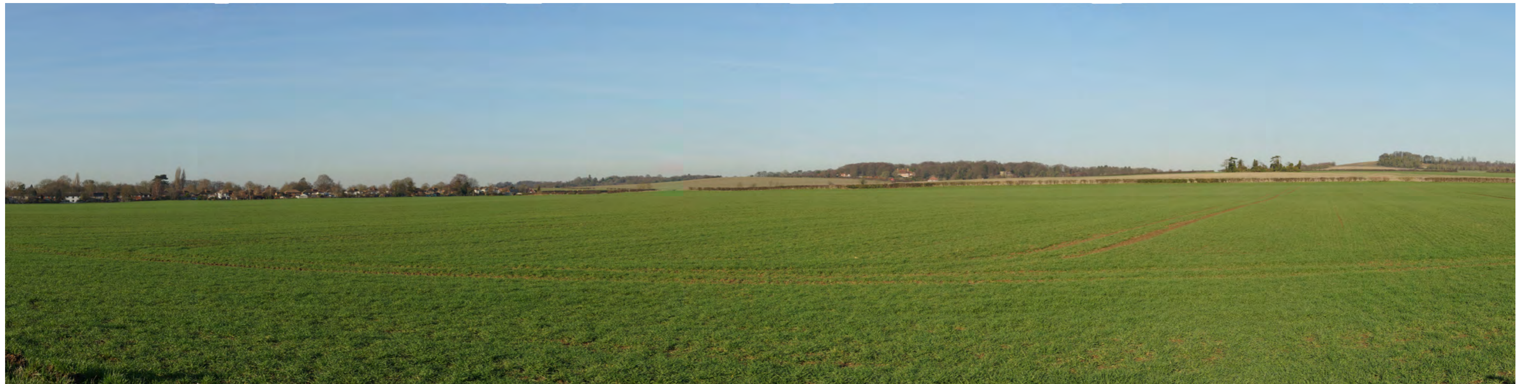
View from Bridleway Stapleford 2 looking north-west - Viewpoint K (Winter)