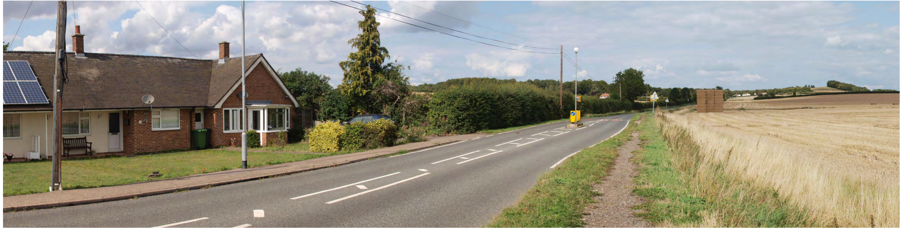
View from Haverhill Road looking north - Viewpoint D (Summer)