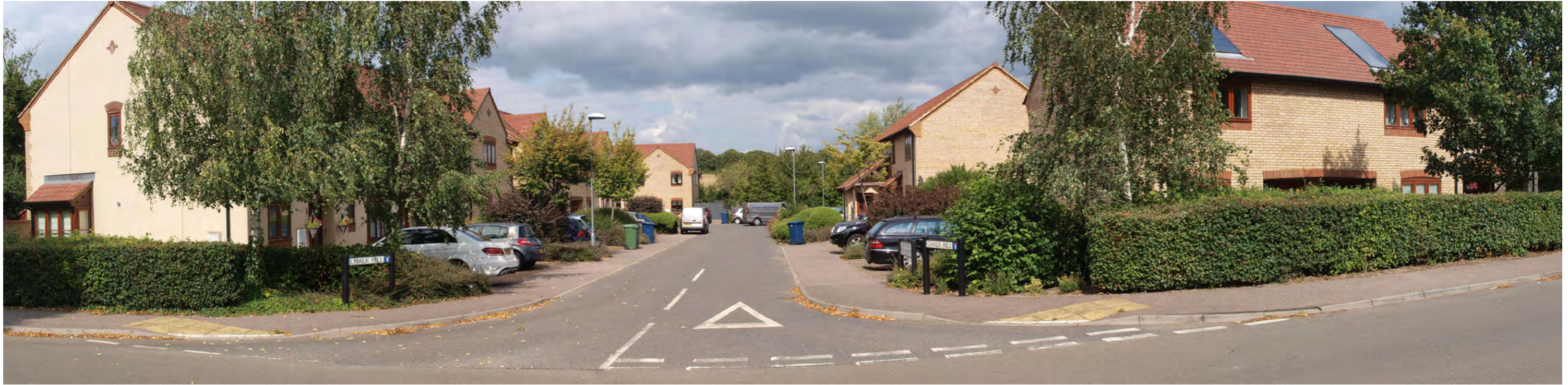
View from Gog Magog Way looking north-east along Chalk-Hill - Viewpoint B (Summer)