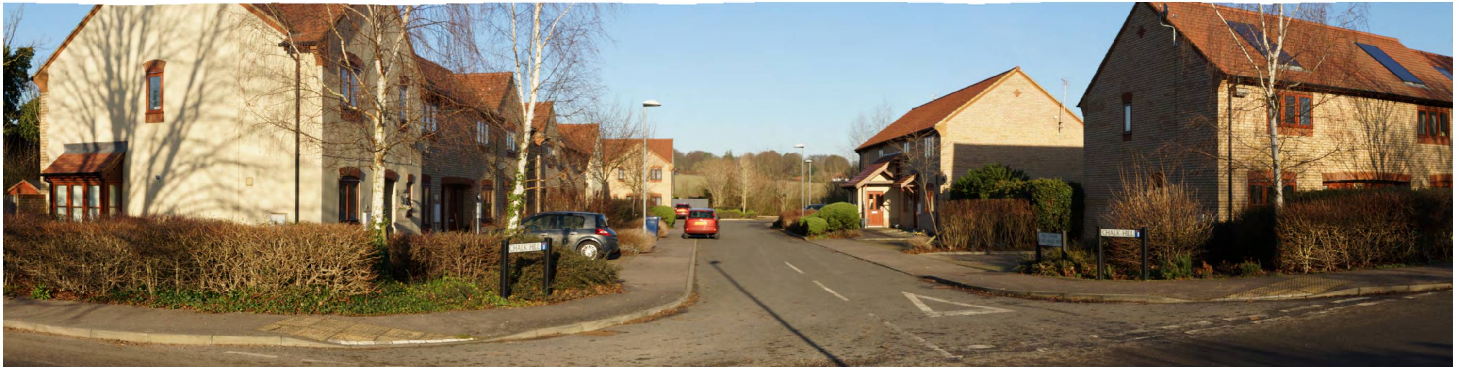
View from Gog Magog Way looking north-east along Chalk-Hill - Viewpoint B (Winter)