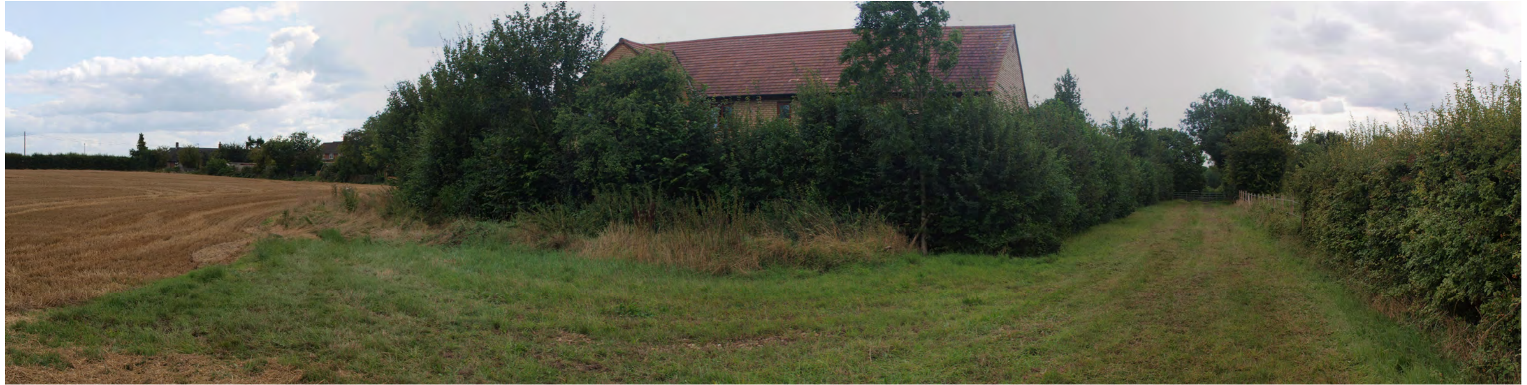
View of Site (Area A) looking east - Viewpoint 1a (RMS View)