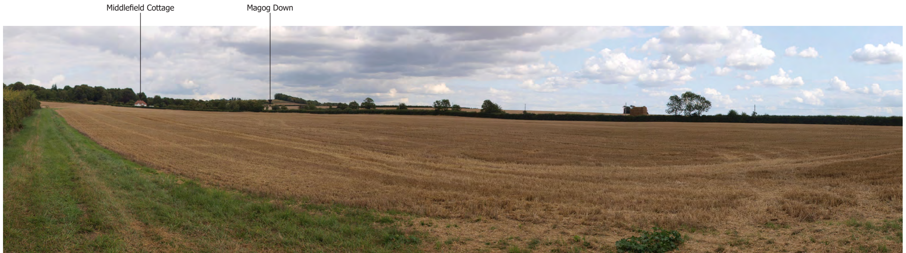
View of Site (Area A & Area B) looking east - Viewpoint 1b (LHS View)