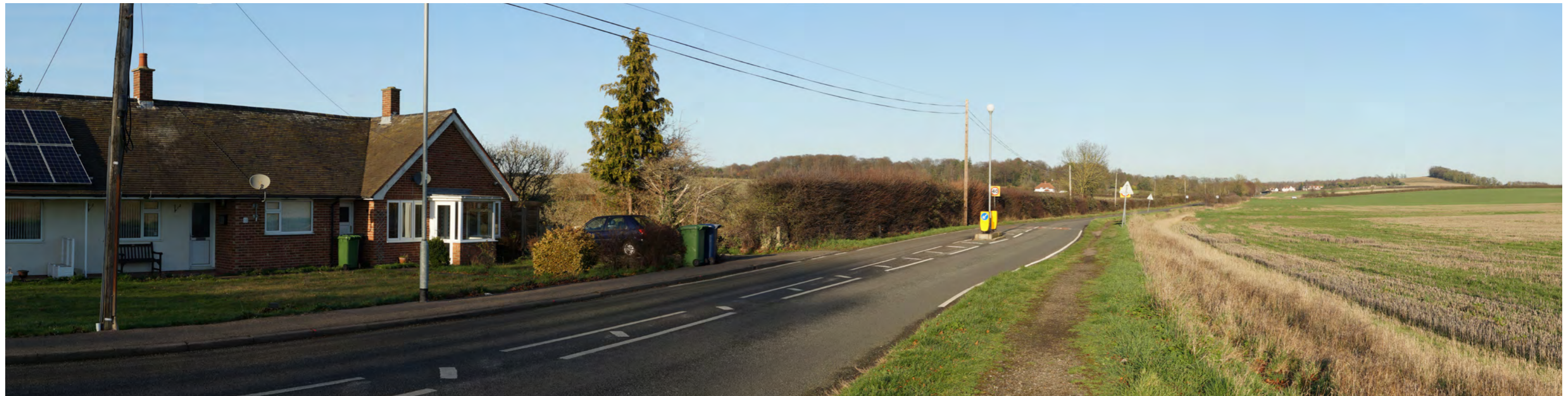
View from Haverhill Road looking north - Viewpoint D (Winter)