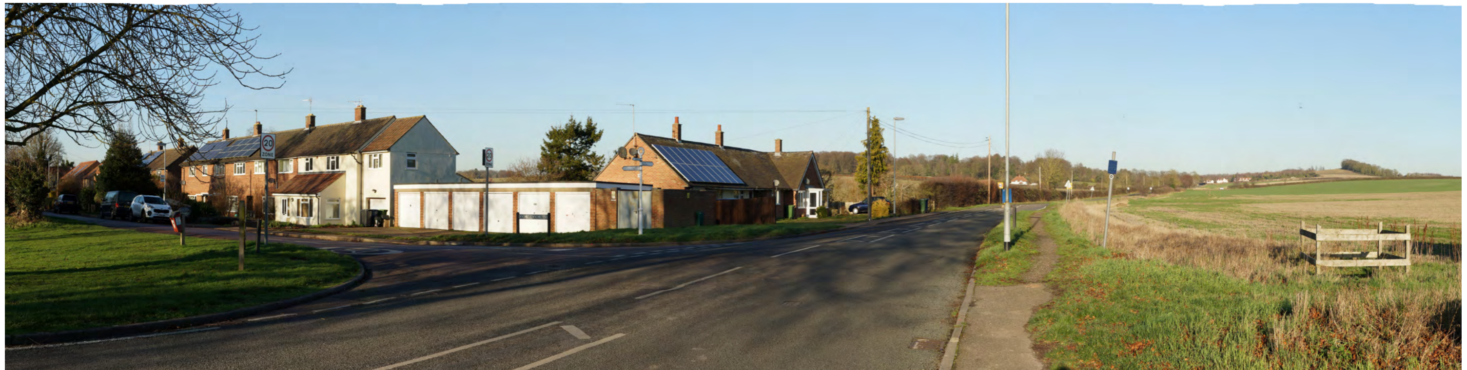
View from Haverhill Road looking north - Viewpoint C (Winter)