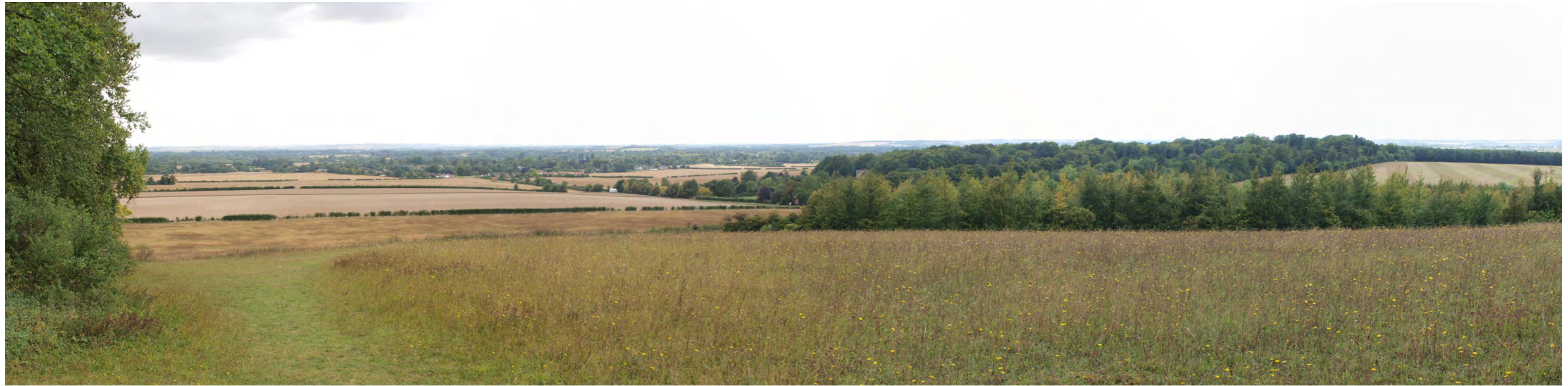
View from Little Trees Hill/Magog Down looking south-west - Viewpoint J (Summer)