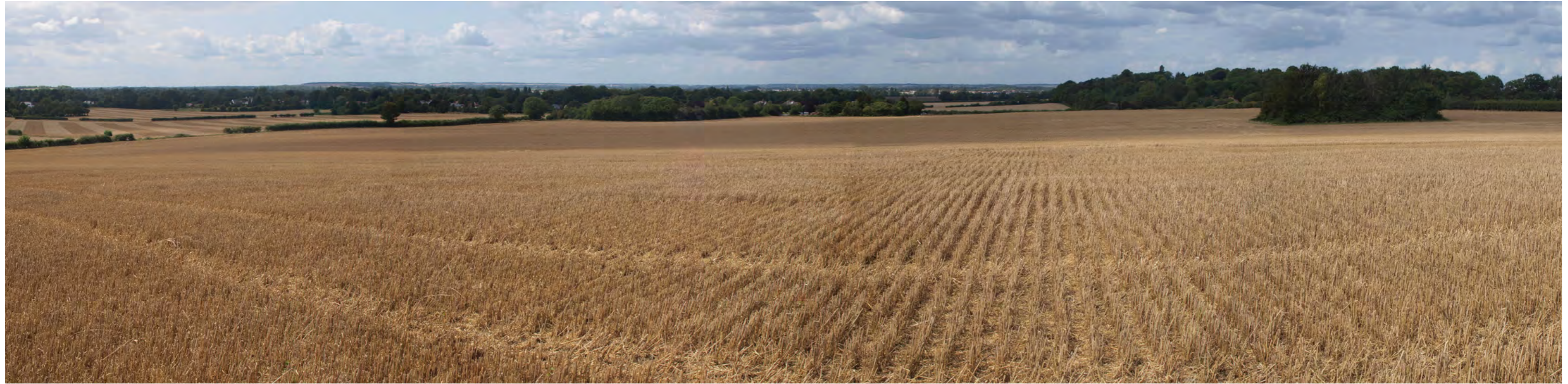
Panoramic View from high point of Site looking to south-west - Viewpoint 3a (RHS View)