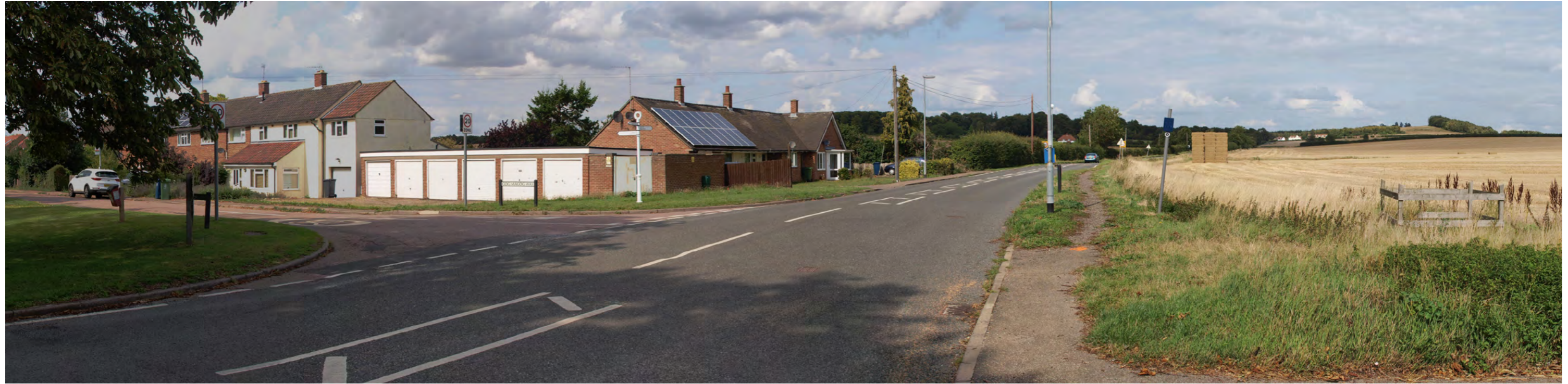
View from Haverhill Road looking north - Viewpoint C (Summer)