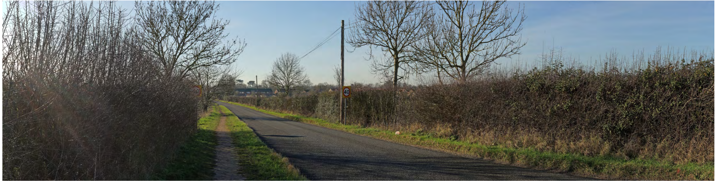
View from Haverhill Road looking south-west at entrance to Middlefield Cottage - Viewpoint G (Winter)