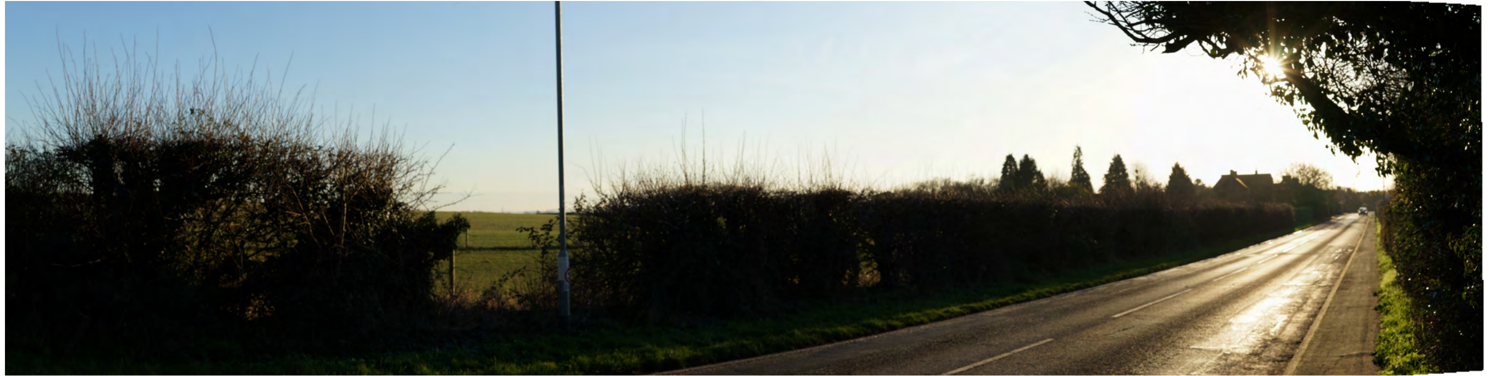
View from Hinton Way looking south-east - Viewpoint L