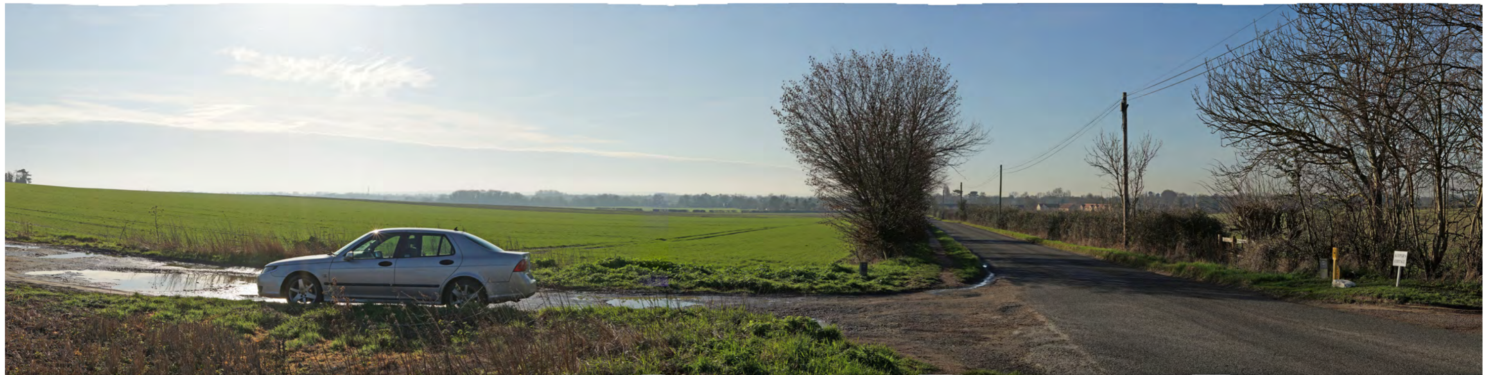
View from Haverhill Road - Viewpoint H (Winter)