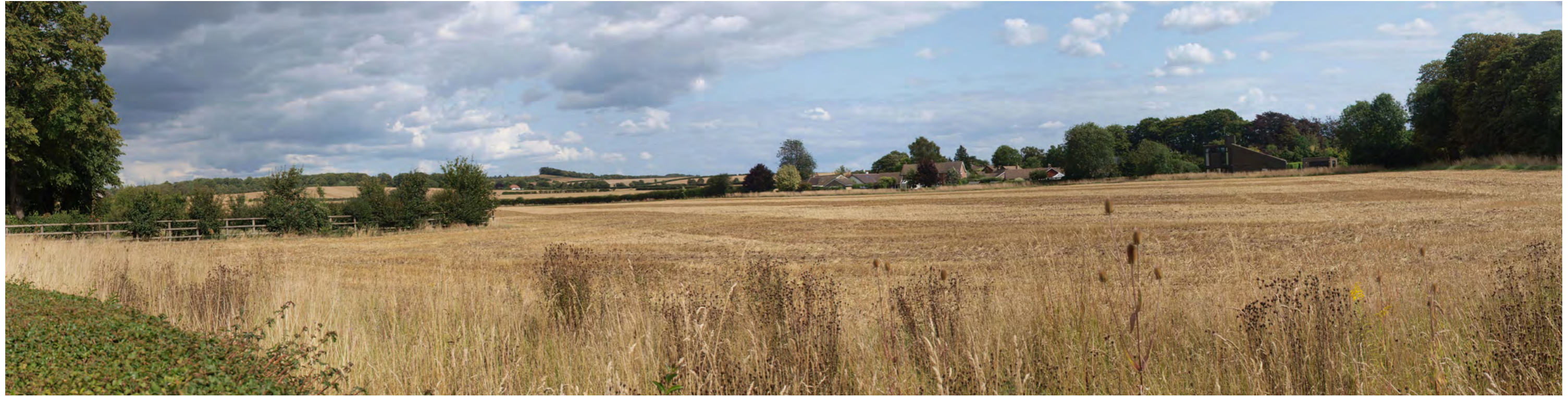
View from access road to Stapleford cemetery looking north-east - Viewpoint F (Summer)