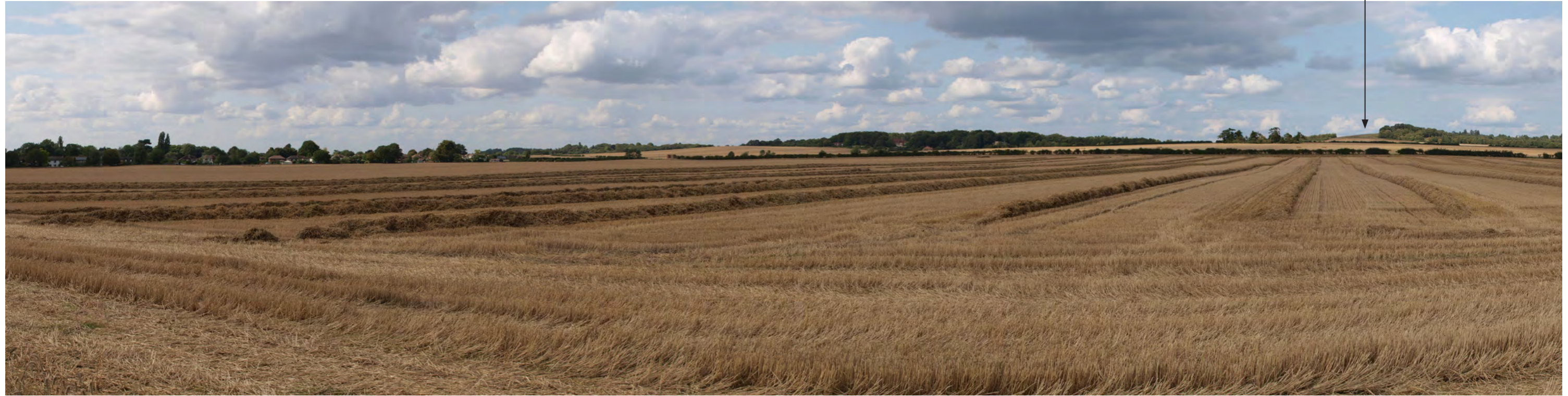
View from Bridleway Stapleford 2 looking north-west - Viewpoint K (Summer)