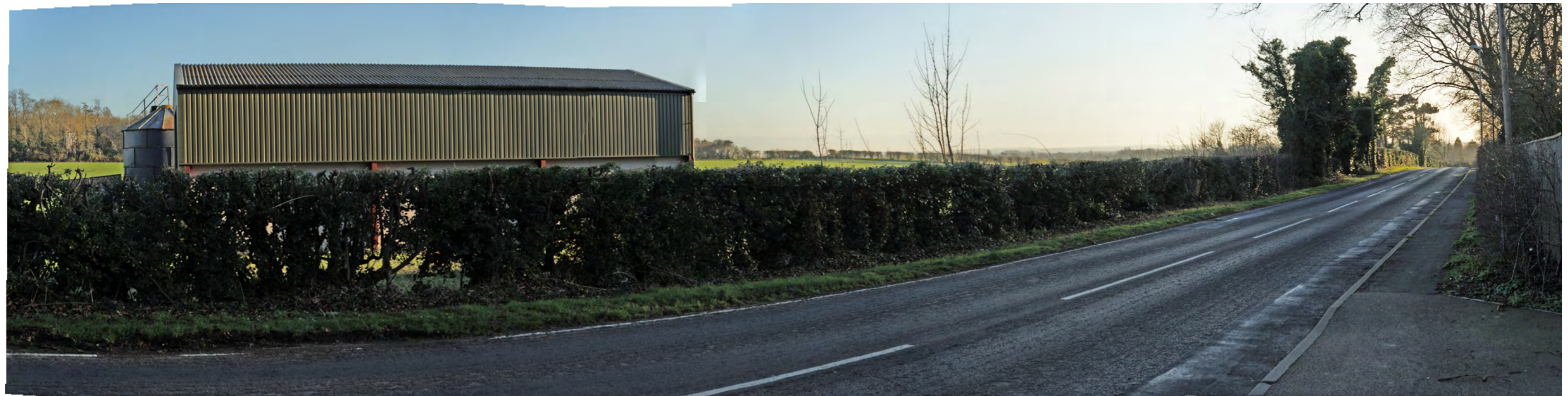
View from Hinton Way looking south-east - Viewpoint M