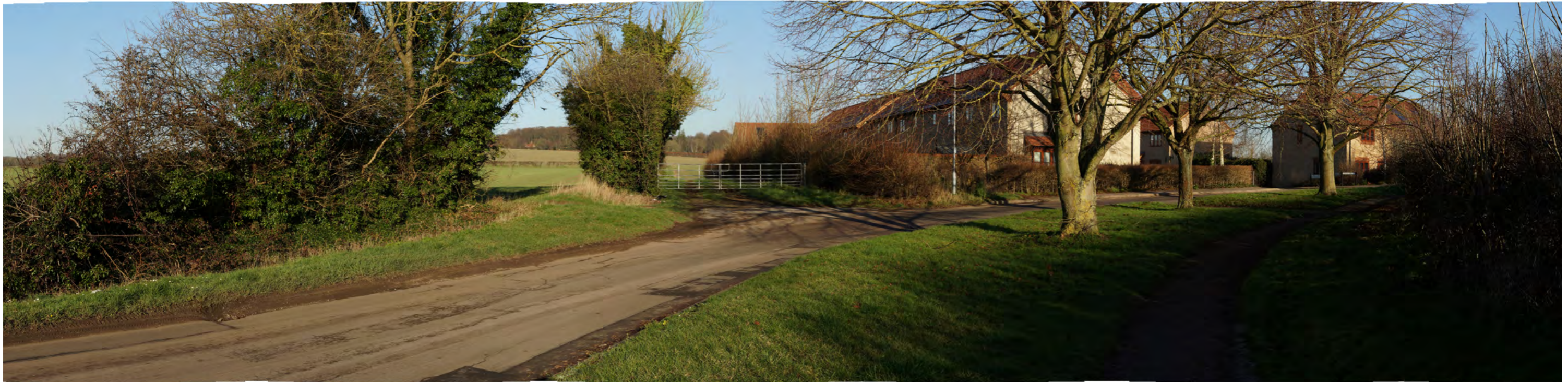
View from Gog Magog Way looking north-east near south-west corner - Viewpoint A (Winter)