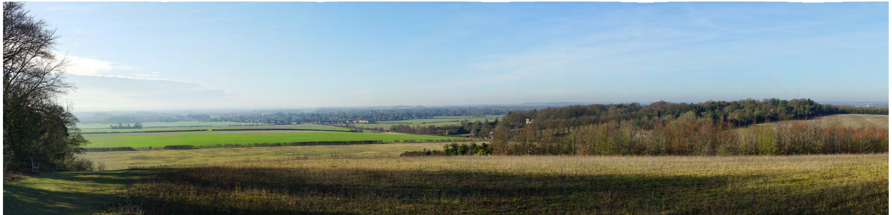
View from Little Trees Hill/Magog Down looking south-west - Viewpoint J (Winter)