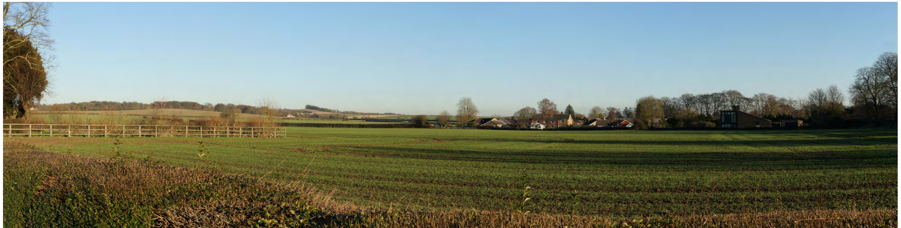
View from access road to Stapleford cemetery looking north-east - Viewpoint F (Winter)