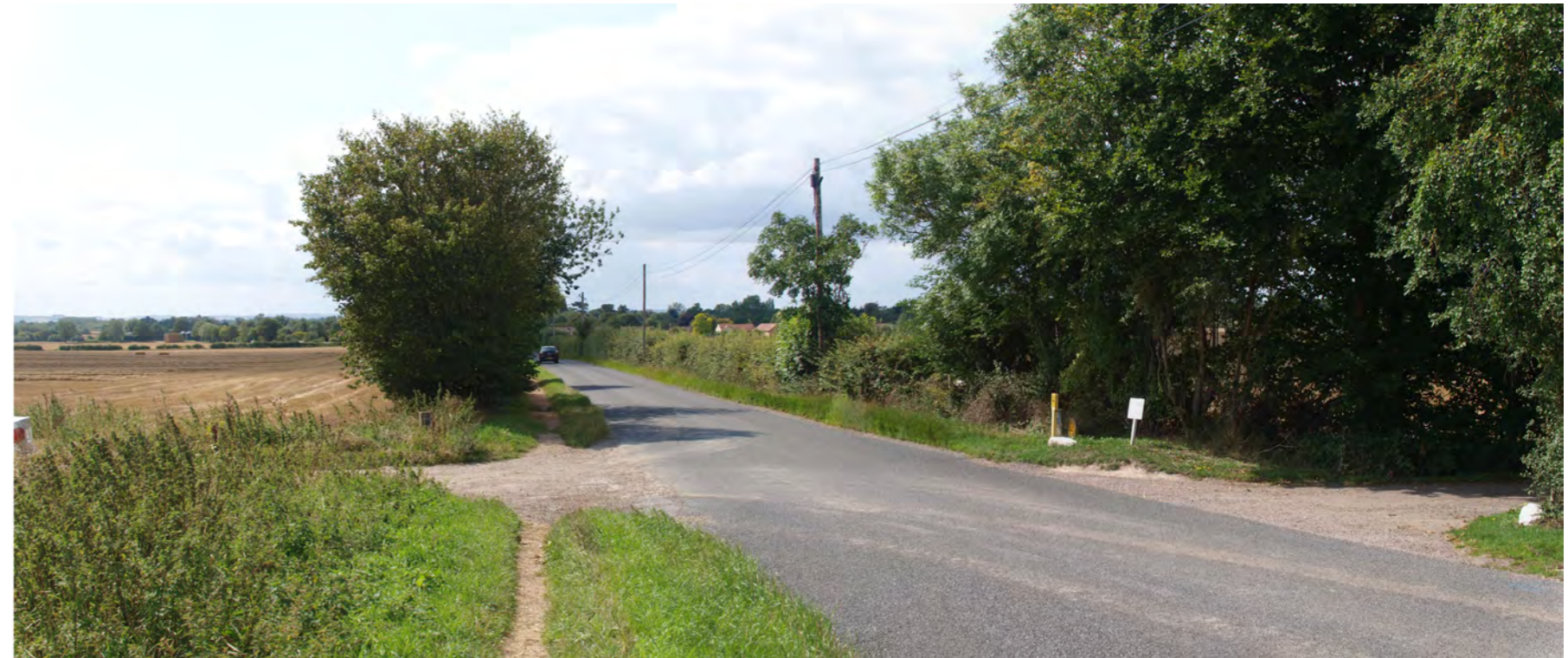
View from Haverhill Road - Viewpoint H (Summer)