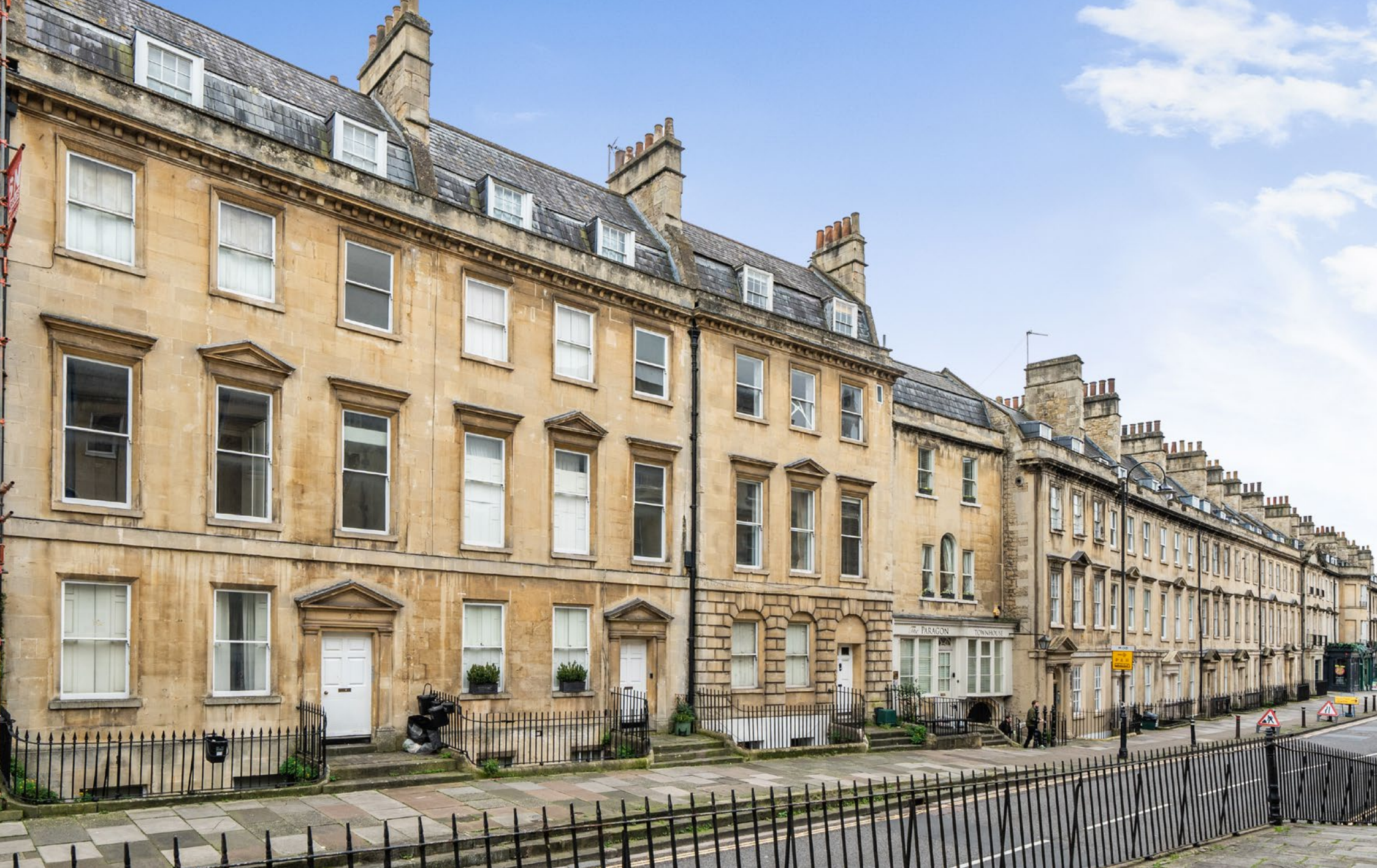
FLAT 4, 3 PARAGON, Bath