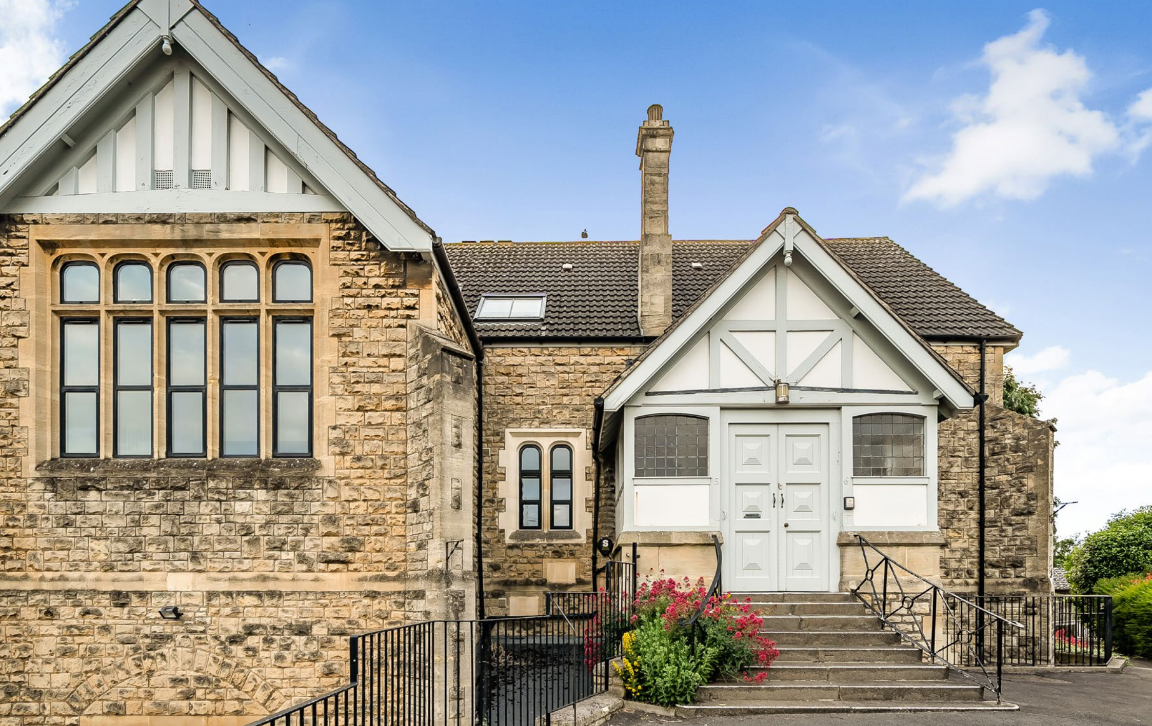
THE OLD METHODIST CHURCH Bath