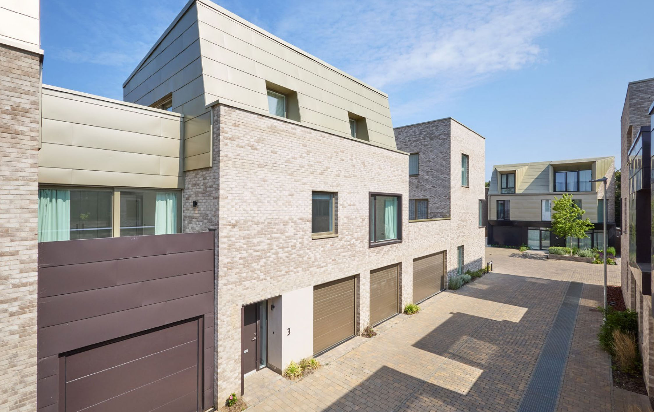
STICKFAST PLACE Cambridge, CB3 1AZ