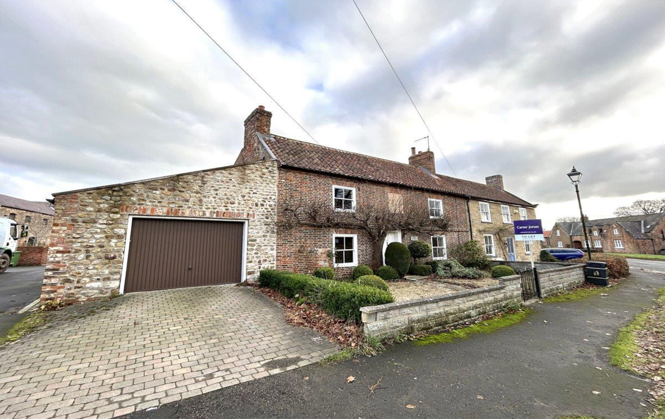
THE OLD ACADEMY, KIRKLINGTON, BEDALE, NORTH YORKSHIRE, DL8 2ND £1,800 per month