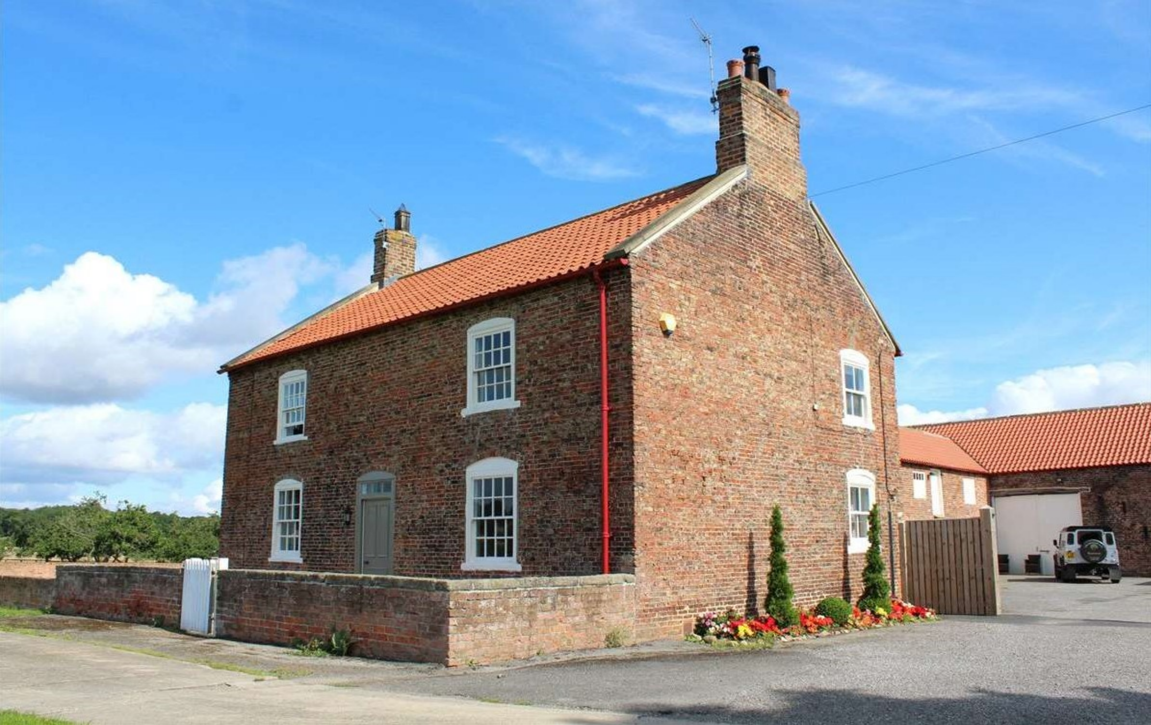
OATLANDS FARM, WALSHFORD, WETHERBY, LS22 5JH £2,850 per month