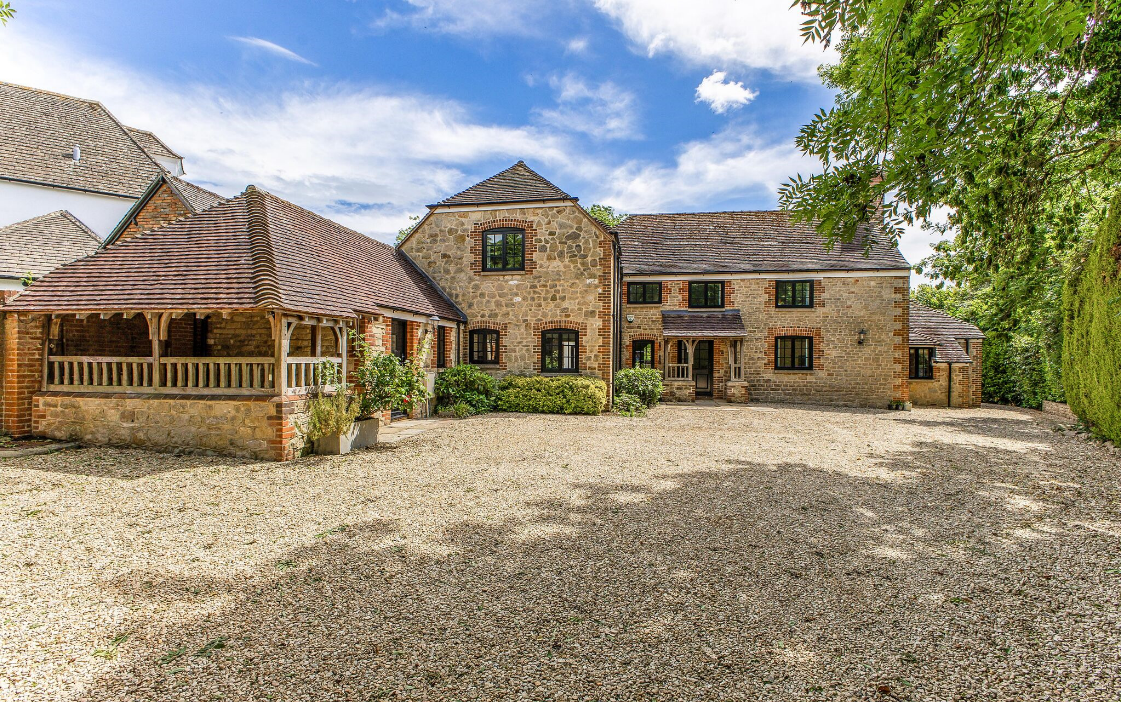
BROOME MANOR COTTAGE, BROOME MANOR LANE