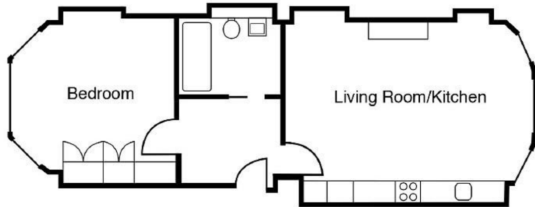
Apartment 3 Ground Floor 531 sq ft / 49 sq m