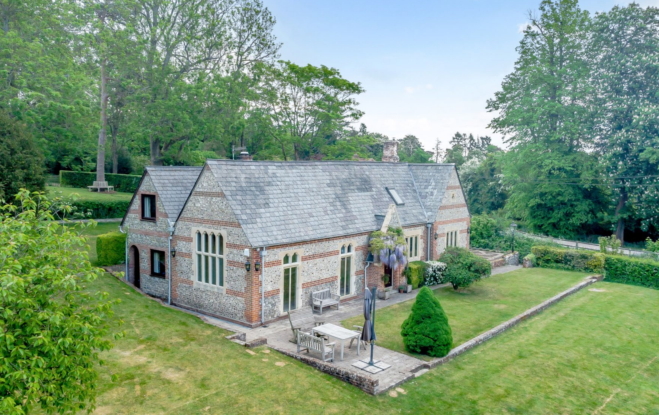
SEXTON'S COTTAGE Guide Price £1,200,000