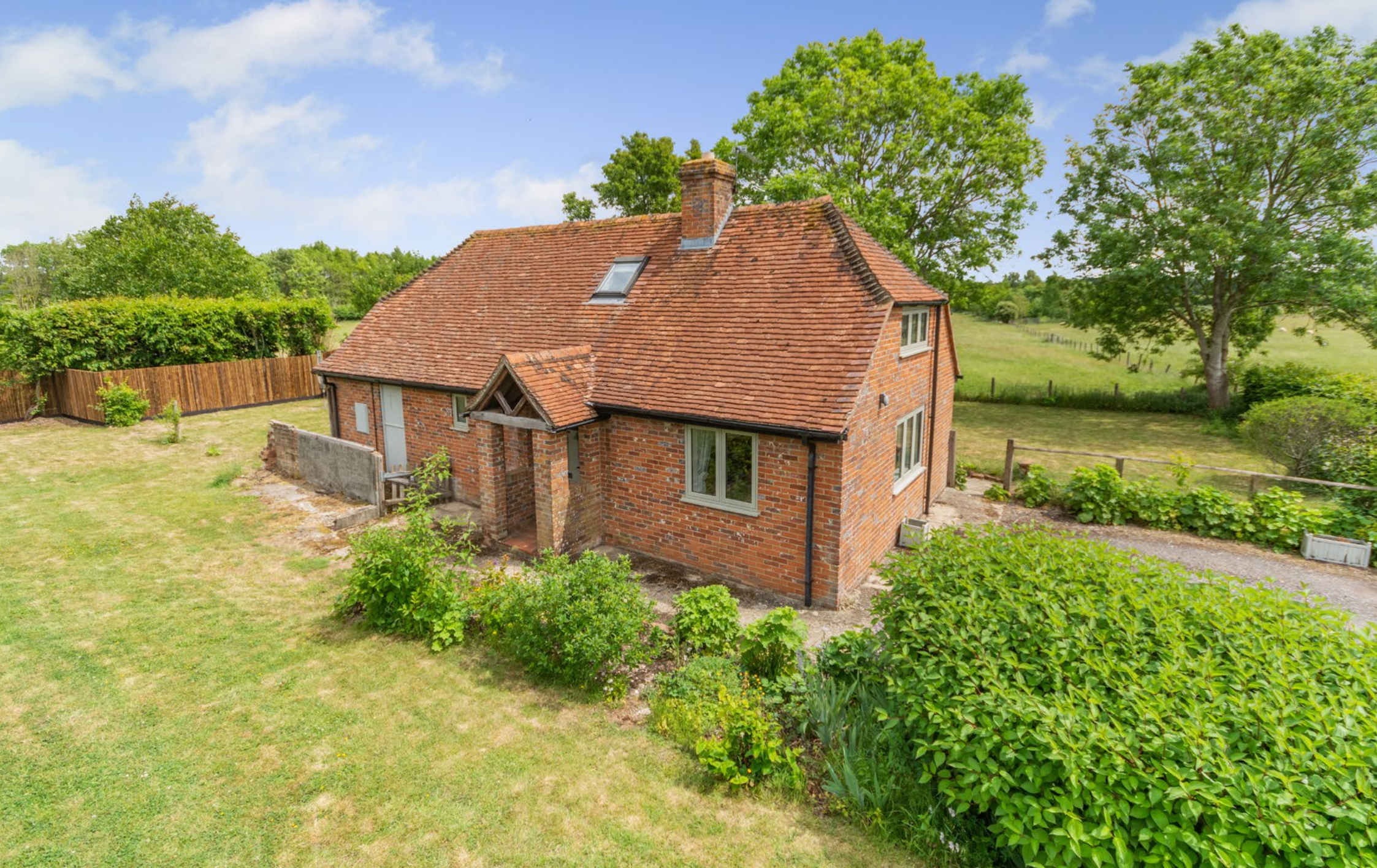
THE BARN COTTAGE Guide Price £675,000