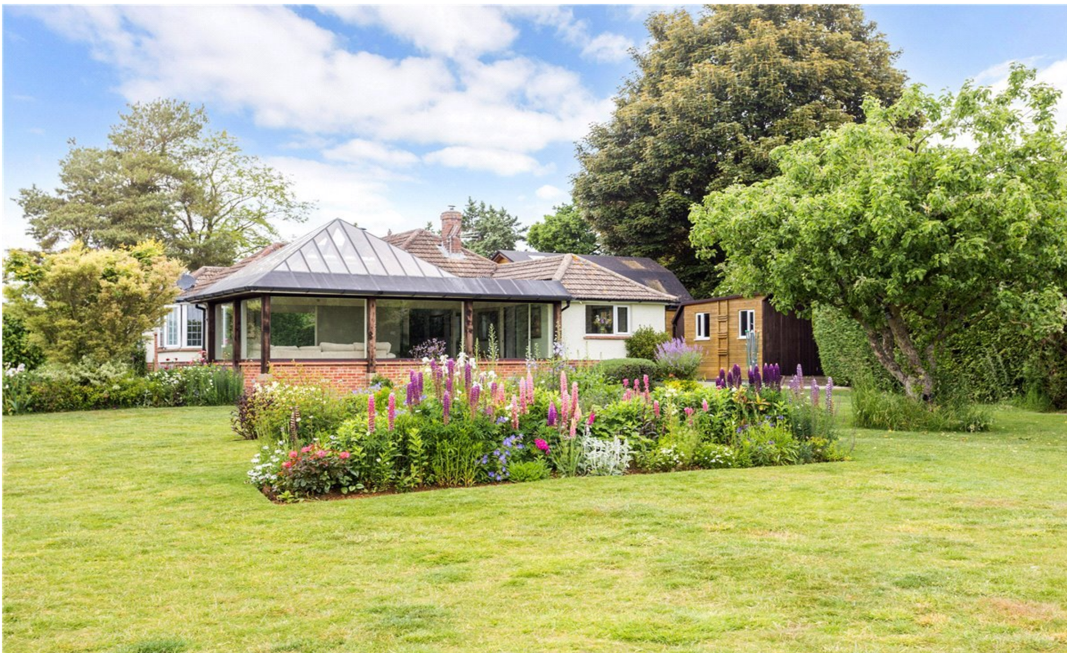
THE THICKET, LECKHAMPSTEAD, RG20 8QW £2,500 per month*