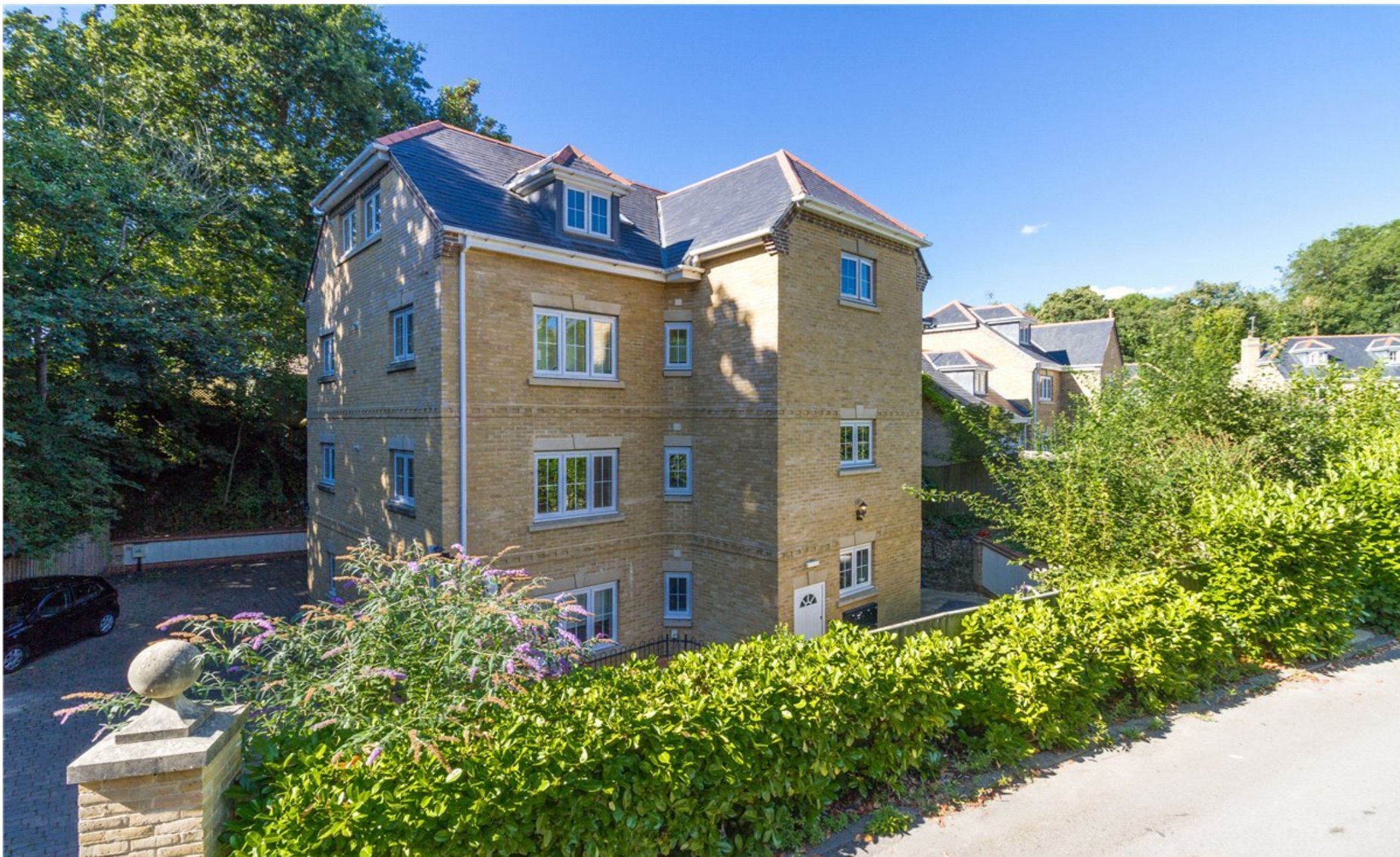
AMARNA HOUSE, DOUGLAS DOWNES CLOSE, OX3 £1,400 per month*