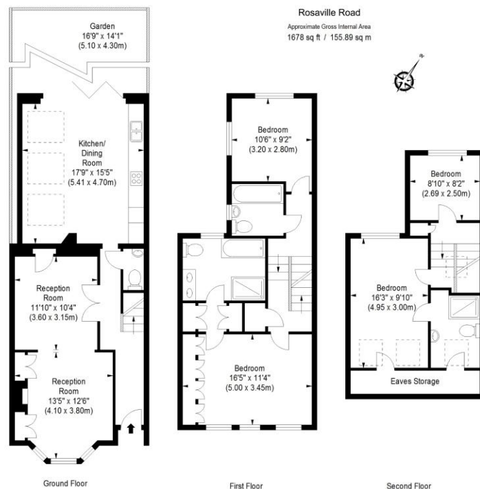
ILLUSTRATION FOR IDENTIFICATION PURPOSES ONLY

ALL MEASUREMENTS ARE MAXIMUM, AND INCLUDE WINDOW BAYS AND WARDROBES WHERE APPLICABLE THIS PLAN MUST NOT BE REPRODUCED BY ANY OTHER PERSON WITHOUT PERMISSION