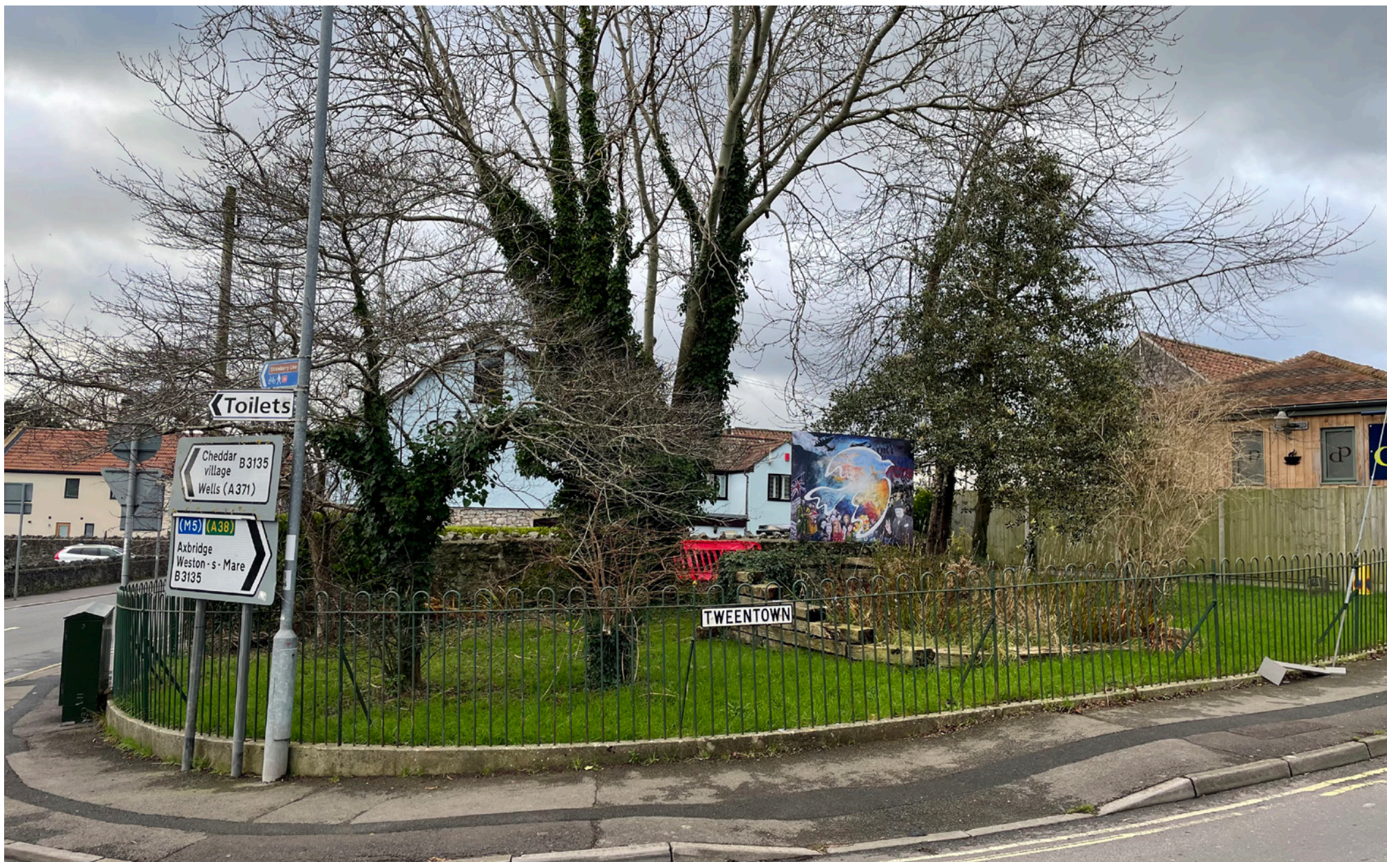
Land adjoining Cliff Street and the B3135