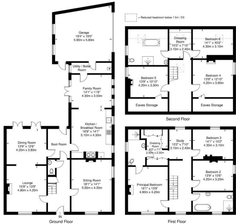
ILLUSTRATION FOR IDENTIFICATION PURPOSES ONLY ALL MEASUREMENT ARE MAXIMUM, AND INCLUDE WINDOW BAYS AND WARDROBES WHERE APPLICABLE THIS PLAN MUST NOT BE REPRODUCED BY ANY OTHER PERSON WITHOUT PERMISSION

Approximate Gross Internal Area = 338.1 sq m / 3640 sq ft