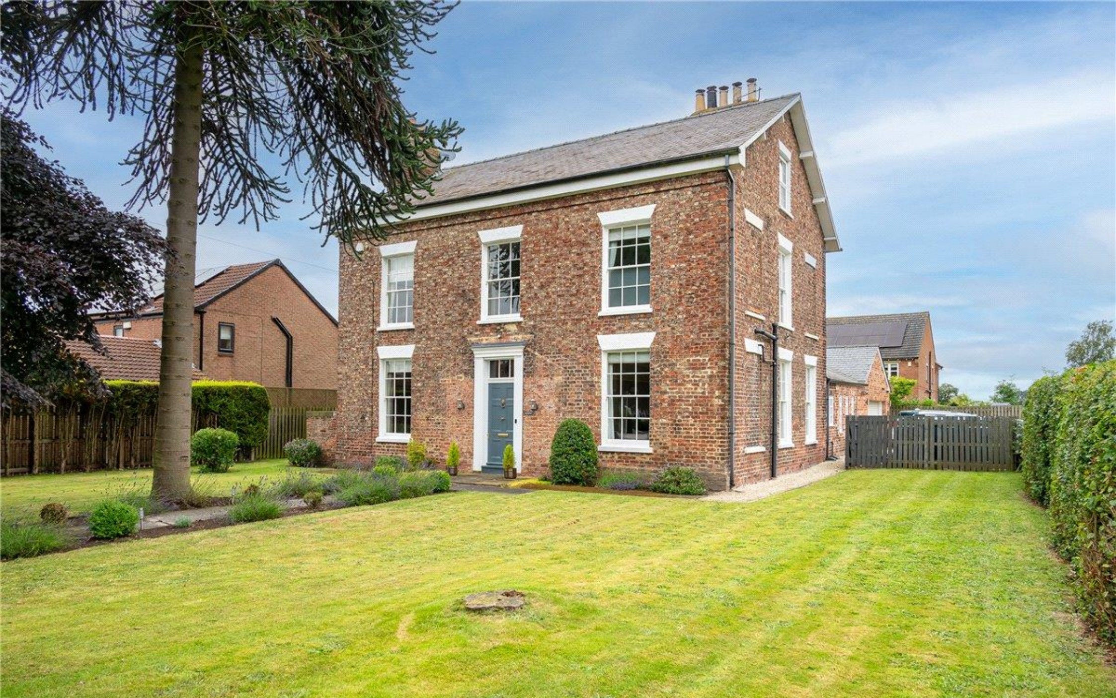
THE BEECHES, MAIN STREET, NORTH DUFFIELD £799,000