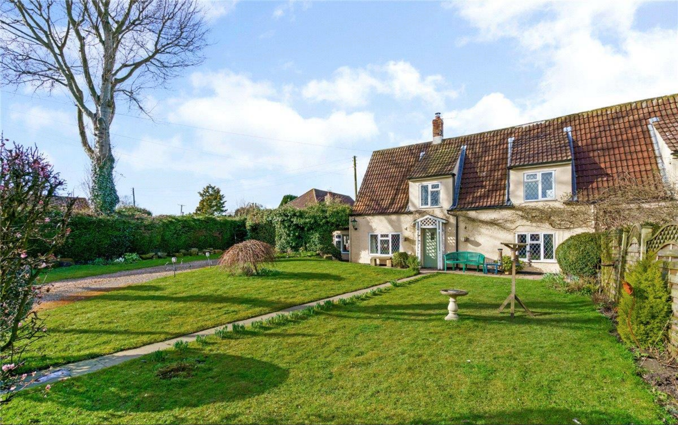
IVY COTTAGE, MAUNBY, THIRSK £465,000