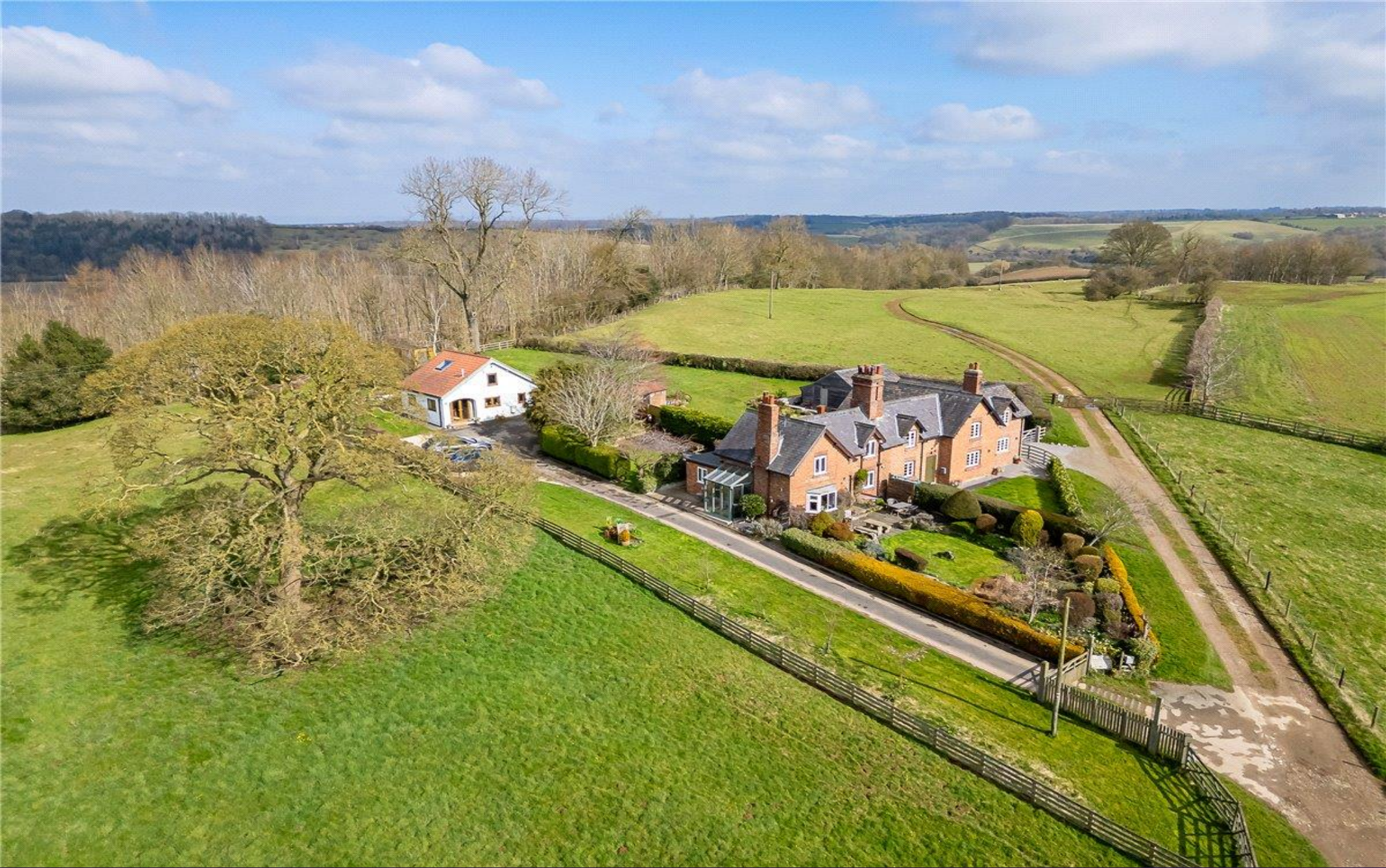
1 WOODEND COTTAGES, HIGH STITTENHAM, YO60 7TW £695,000