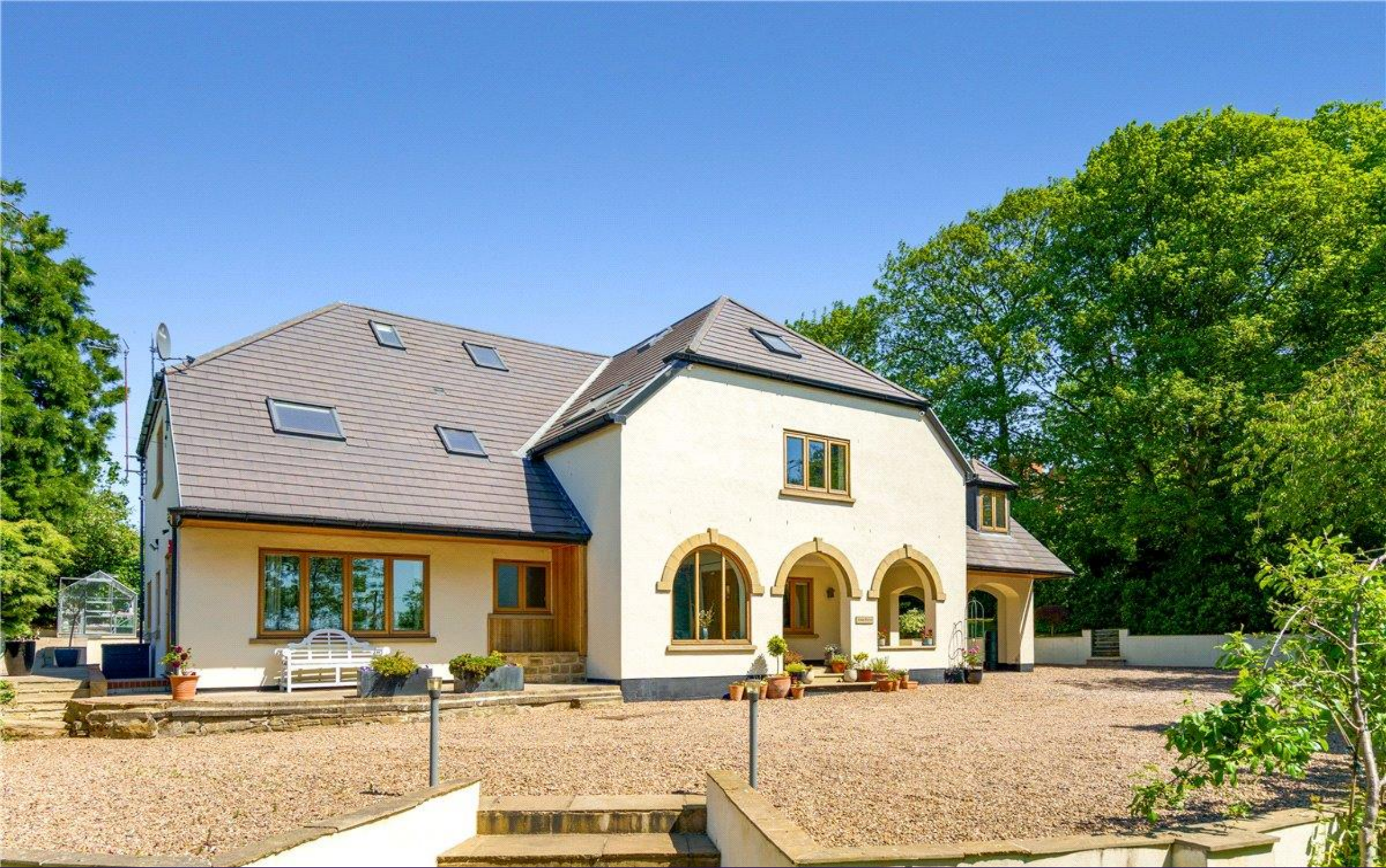
YORK HOUSE, CARLETON ROAD £1,500,000